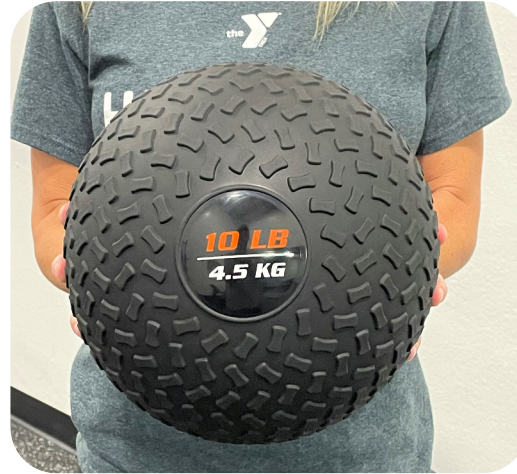
FUNCTIONAL FITNESS ROOM